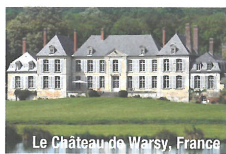
Le Château de Warsy, France

We hope you have enjoyed your visit with us