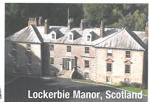
Lockerbie Manor, Scotland

Your views are very important to us. We would greatly appreciate five minutes of your time to complete and return this form to reception prior to your departure