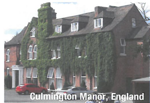
Culmington Manor, England