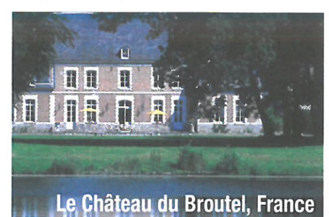
Le Château du Broutel, France

Le Château de Warsy & Le Château du Broutel