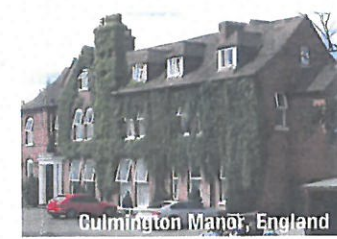
Gulmington Manor, England