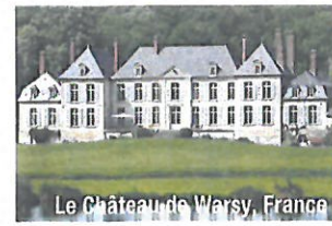
Le Château de Warsy, France

We hope you have enjoyed your visit with us