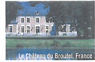
Le Château du Broutel, France

Le Château de Warsy & Le Château du Broutel