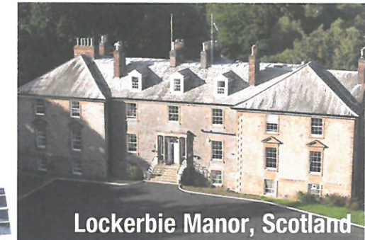
Lockerbie Manor, Scotland

Your views are very important to us. We would greatly appreciate five minutes of your time to complete and return this form to reception prior to your departure