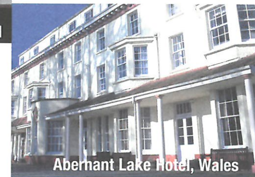
Abernant Lake Hotel, Wales

Your views are very important to us. We would greatly appreciate five minutes of your time to complete and return this form to reception prior to your departure