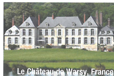
Le Château de Warsy, France

We hope you have enjoyed your visit with us