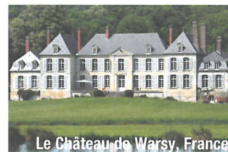
Le Château de Warsy, France

We hope you have enjoyed your visit with us