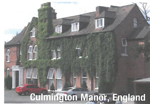
Culmington Manor, England