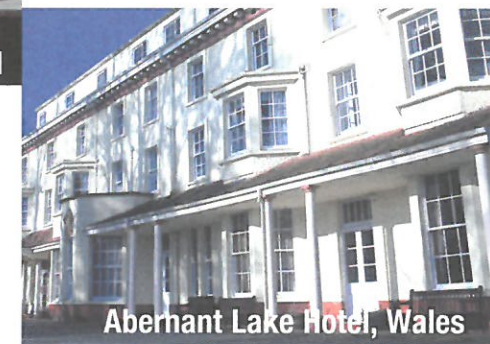
Abernant Lake Hotel, Wales