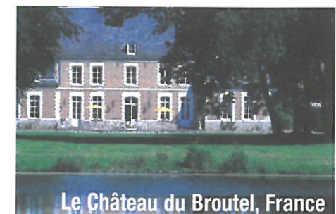
Le Château du Broutel, France

Le Château de Warsy & Le Château du Broutel