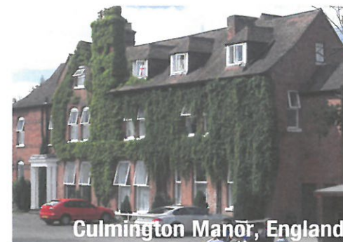
Culmington Manor, England