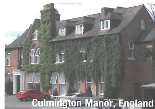
Culmington Manor, England