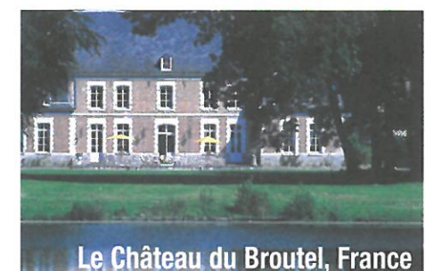
Le Château du Broutel, France

Le Château de Warsy & Le Château du Broutel