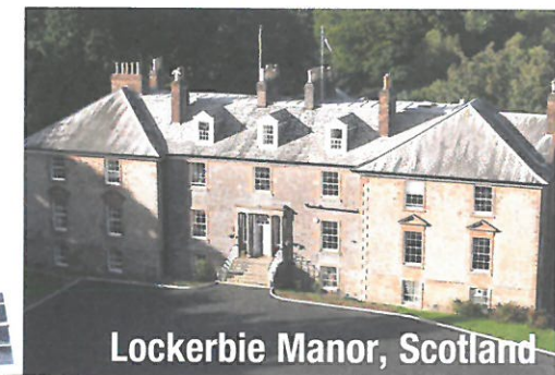
Lockerbie Manor, Scotland