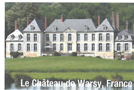
Le Château de Warsy, France

We hope you have enjoyed your visit with us