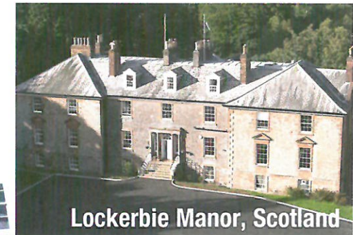
Lockerbie Manor, Scotland

Your views are very important to us. We would greatly appreciate five minutes of your time to complete and return this form to reception prior to your departure