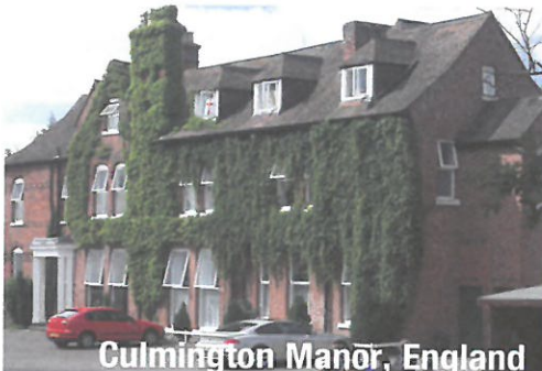
Culmington Manor, England