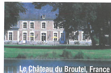
Le Château du Broutel, France

Le Château de Warsy & Le Château du Broutel