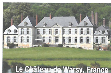
Le Château de Warsy, France

We hope you have enjoyed your visit with us