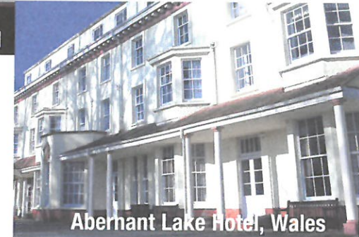
Abernant Lake Hotel, Wales