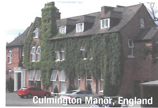
Culmington Manor, England