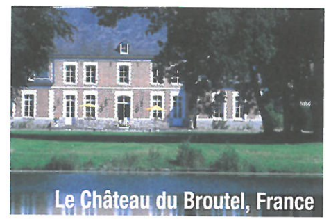
Le Château du Broutel, France

Le Château de Warsy & Le Château du Broutel