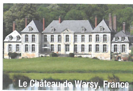
Le Château de Warsy, France

We hope you have enjoyed your visit with us