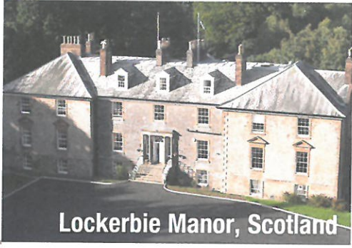
Lockerbie Manor, Scotland