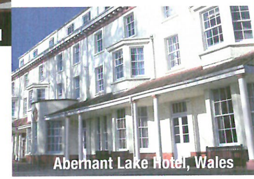
Abernant Lake Hotel, Wales