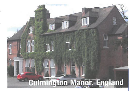
Culmington Manor, England