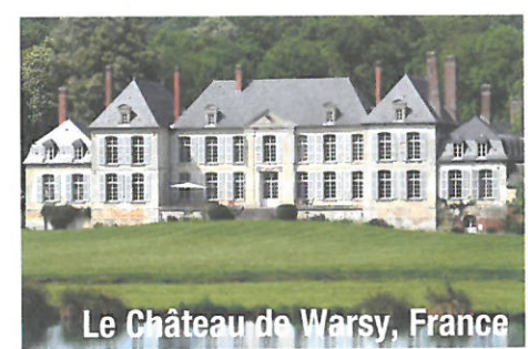
Le Château de Warsy, France

We hope you have enjoyed your visit with us