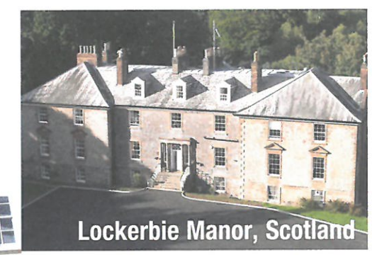
Lockerbie Manor, Scotland