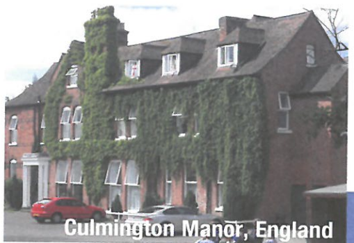
Culmington Manor, England