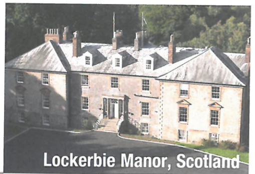
Lockerbie Manor, Scotland