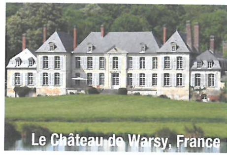
Le Château de Warsy, France

We hope you have enjoyed your visit with us