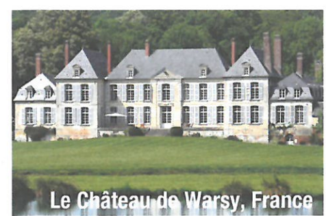
Le Château de Warsy, France

We hope you have enjoyed your visit with us