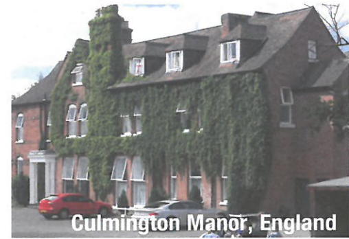
Culmington Manor, England