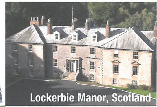
Lockerbie Manor, Scotland