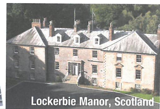
Lockerbie Manor, Scotland

Your views are very important to us. We would greatly appreciate five minutes of your time to complete and return this form to reception prior to your departure