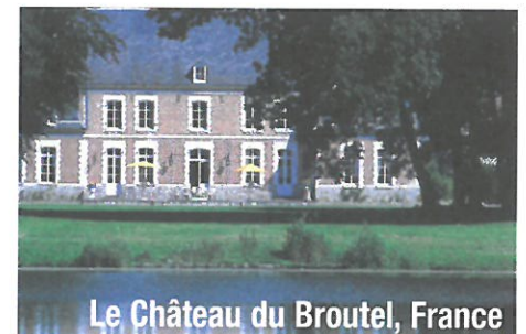
Le Château du Broutel, France

Le Château de Warsy & Le Château du Broutel