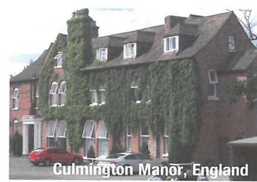
Culmington Manor, England