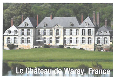
Le Château de Warsy, France

Head office: Culmington Manor, Craven Arms, Shropshire, SY7 9BY Telephone: 01584 861333 Fax: 01584 861367 www.manoradventure.com