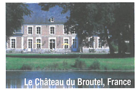
Le Château du Broutel, France

Have you considered our French Centres Le Château de Warsy & Le Château du Broutel