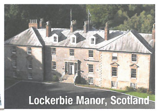
Lockerbie Manor, Scotland

Your views are very important to us. We would greatly appreciate five minutes of your time to complete and return this form to reception prior to your departure