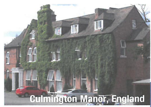
Culmington Manor, England