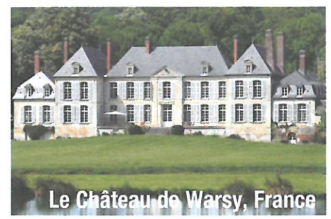
Le Château de Warsy, France

We hope you have enjoyed your visit with us