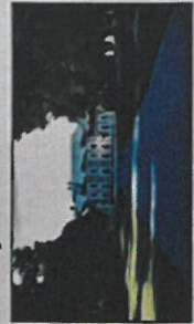
Le Château du Brouel