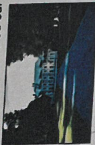
Le Château du Brouel