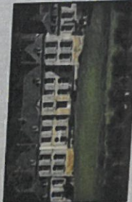
Le Château de Warsy