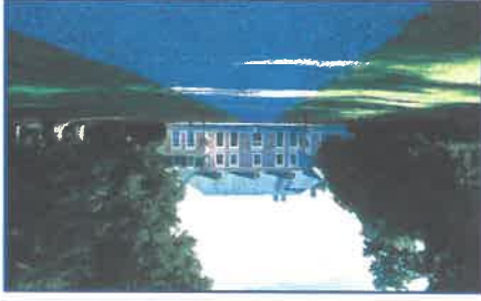
Le Château du Broutel