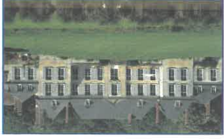
Le Château de Warsy