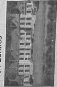
Le Château de Warsy