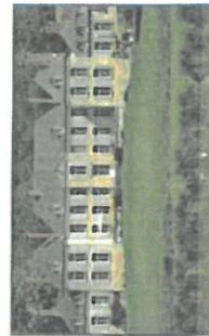
Le Château du Broutel