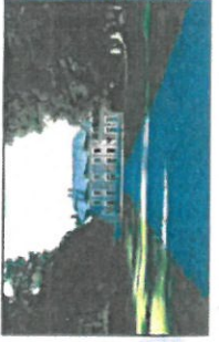
Le Château du Broutel