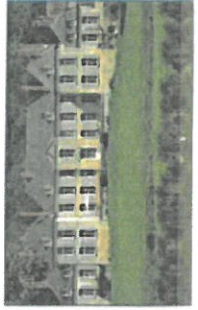
Le Château de Warsy