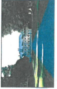
Le Château du Broutel