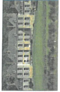
Le Château de Warsy