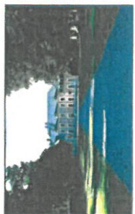
Le Château du Broustel