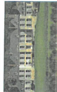
Le Château de Warsy