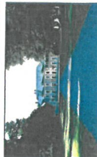
Le Château du Broutel