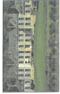
Le Château de Warsy