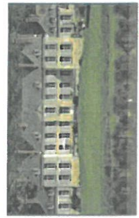
Le Château du Broutel