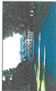
Le Château du Broutel