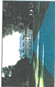
Le Château du Broutel