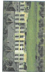
Le Château de Warsyl