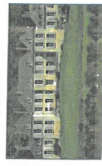
Le Château du Brinell