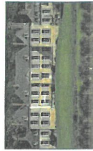
Le Château de Warsy