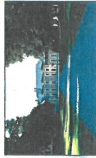
Le Château du Broutel