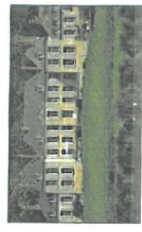
Le Chateau de Warsy