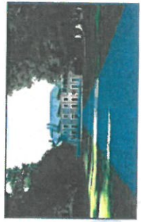
Le Chateau du Broutel