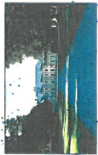
Le Château du Broutel