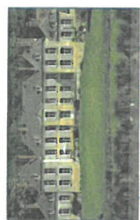
Le Château de Warsy