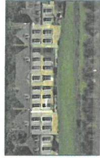
Le Château de Warsy