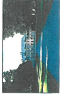
Le Château du Brouel