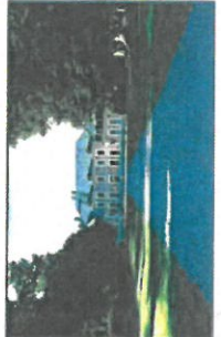
Le Château du Broutel