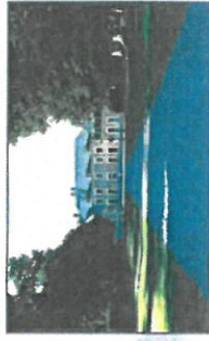
Le Château du Broutel