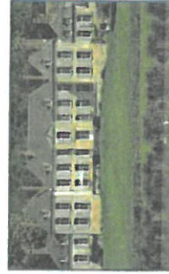
Le Château de Warsy