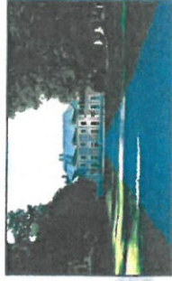
Le Château du Broutel