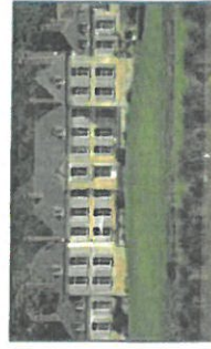
Le Château de Warsy