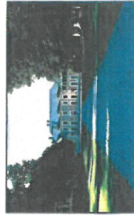
Le Château du Broutel