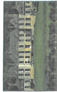
Le Château de Warsy