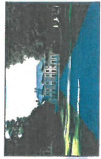
Le Château du Broutel