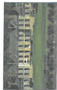
Le Château de Warsy