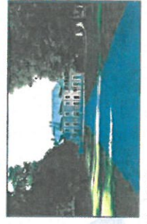
Le Château du Broutel