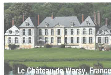
Le Château de Warsy, France

We hope you have enjoyed your visit with us