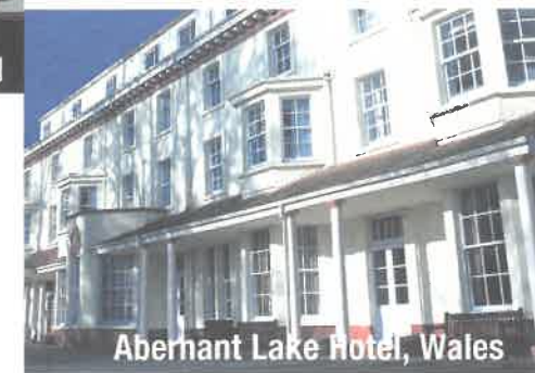
Abernant Lake Hotel, Wales

Your views are very important to us. We would greatly appreciate five minutes of your time to complete and return this form to reception prior to your departure