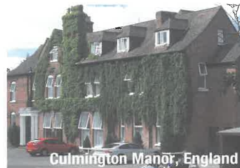
Culmington Manor, England