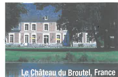
Le Château du Broutel, France

Le Château de Warsy & Le Château du Broutel