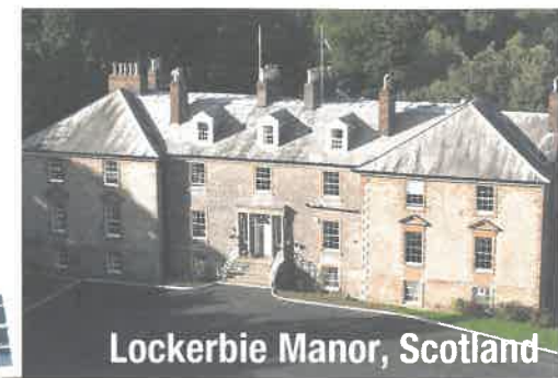
Lockerbie Manor, Scotland