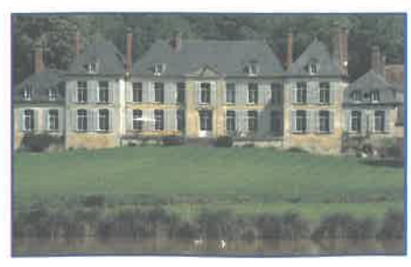
Le Château de Warsy