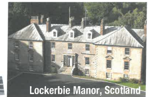
Lockerbie Manor, Scotland