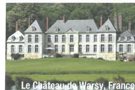
Le Château de Warsy, France

We hope you have enjoyed your visit with us