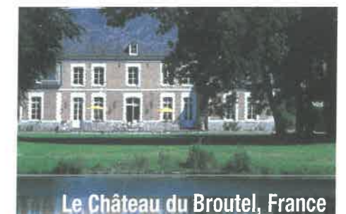
Le Château du Broutel, France

Le Château de Warsy & Le Château du Broutel