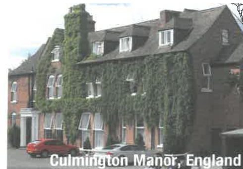
Culmington Manor, England