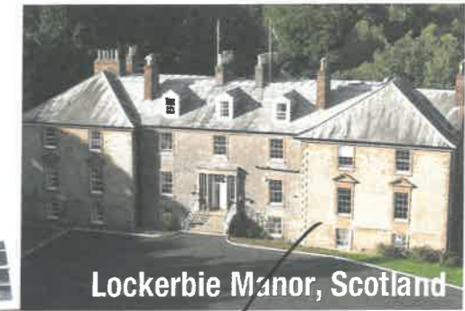
Lockerbie Manor, Scotland

Your views are very important to us. We would greatly appreciate five minutes of your time to complete and return this form to reception prior to your departure