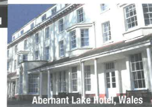
Aberhant Lake Hotel, Wales