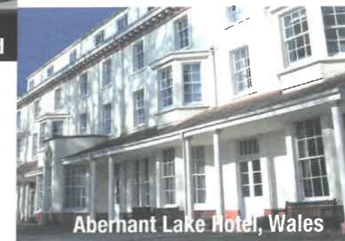
Aberhant Lake Hotel, Wales