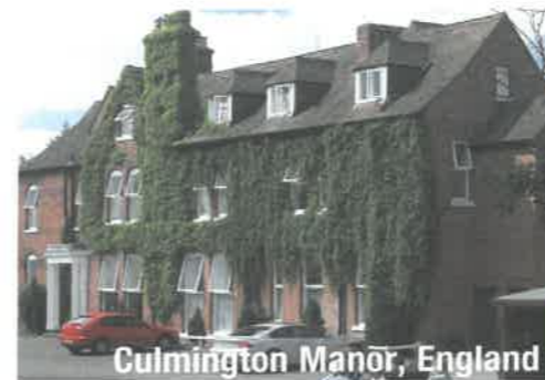
Culmington Manor, England