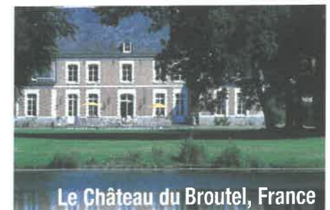
Le Château du Broutel, France

Le Château de Warsy & Le Château du Broutel