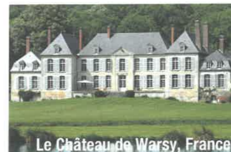
Le Château de Warsy, France

We hope you have enjoyed your visit with us