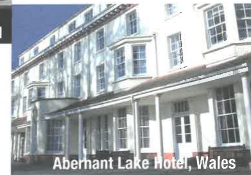
Aberhant Lake Hotel, Wales