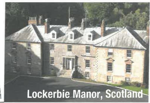
Lockerbie Manor, Scotland

Your views are very important to us. We would greatly appreciate five minutes of your time to complete and return this form to reception prior to your departure