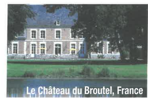
Le Château du Broutel, France

Le Château de Warsy & Le Château du Broutel