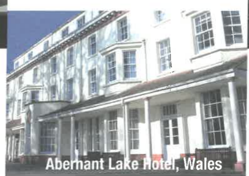
Abernant Lake Hotel, Wales