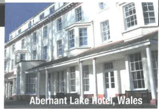
Aberhant Lake Hotel, Wales