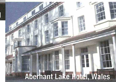
Abernant Lake Hotel, Wales