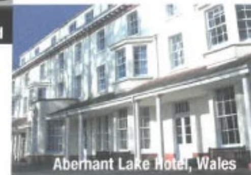
Abernant Lake Hotel, Wales