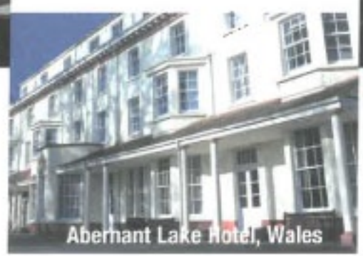
Abernant Lake Hotel, Wales