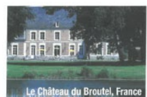
Le Château du Broutel, France

Le Château de Warsy & Le Château du Broutel