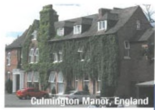
Culmington Manor, England