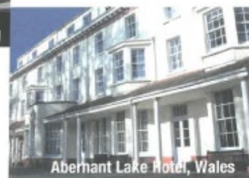
Abernant Lake Hotel, Wales