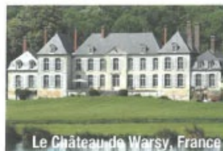
Le Château de Warsy, France

We hope you have enjoyed your visit with us