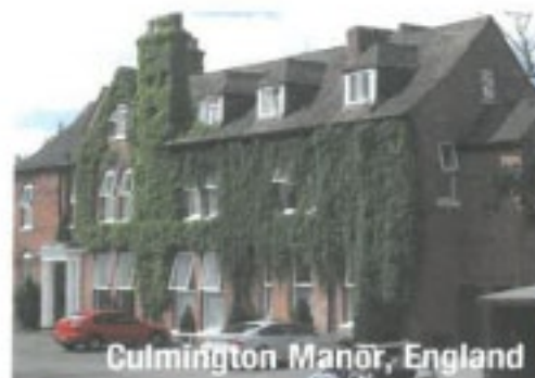
Culmington Manor, England