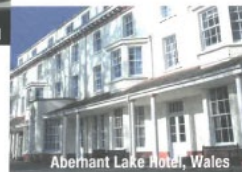
Aberhant Lake Hotel, Wales